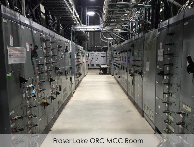
Fraser Lake ORC MCC Room