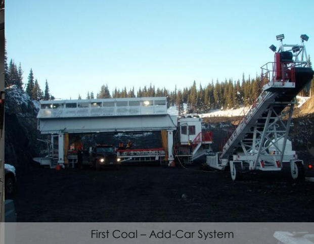
First Coal - Add-Car System