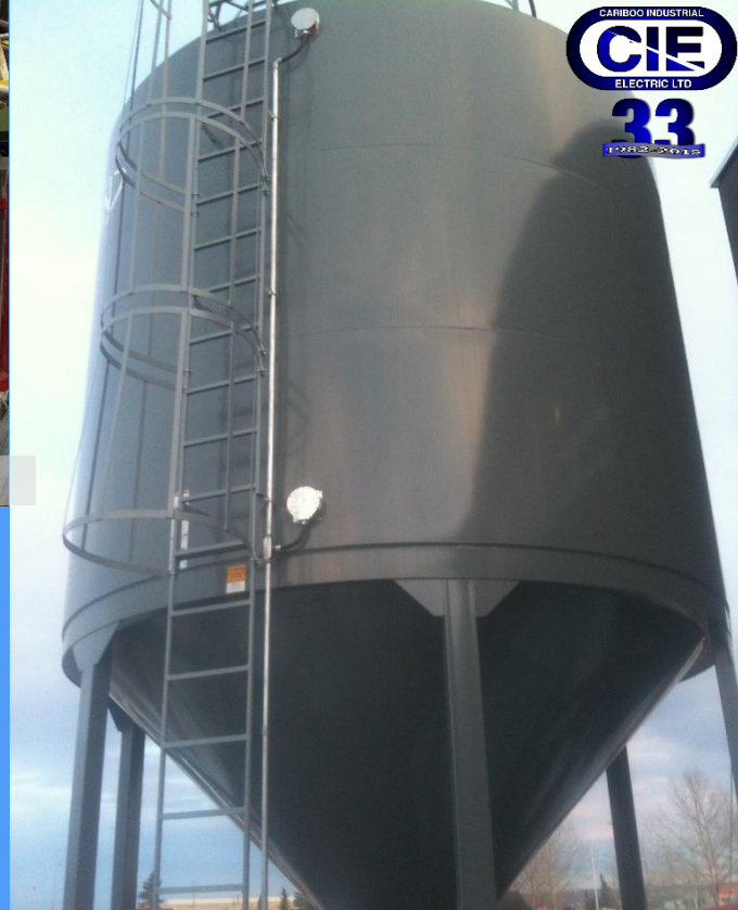
Northern Lights College Energy House