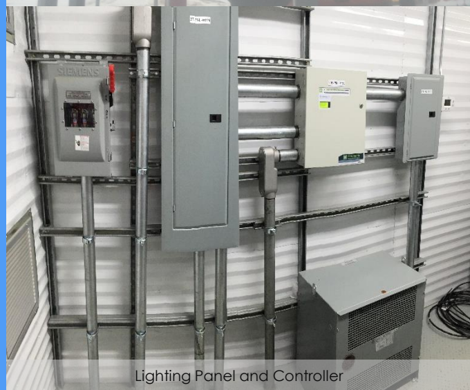
Lighting Panel and Controller