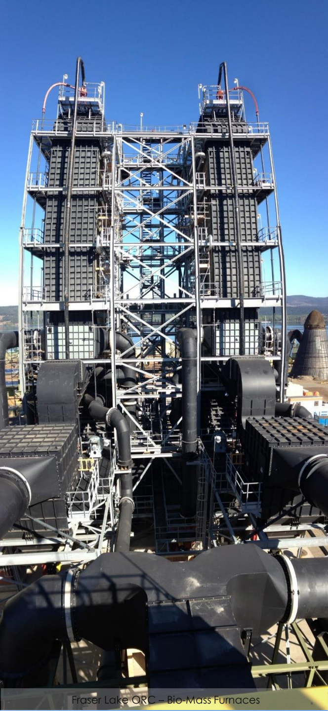
Fraser Lake ORC – Bio-Mass Furnaces