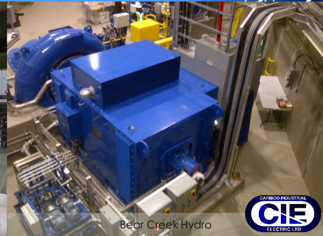
Bear Creek Hydro