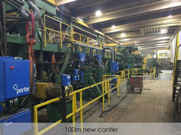
100m new canter